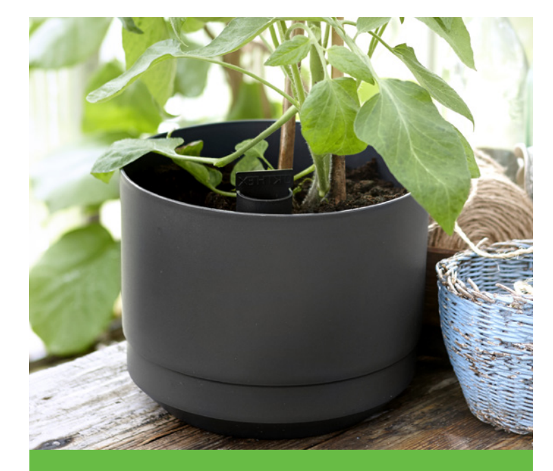
The measuring stick shows when it's time to top up the water