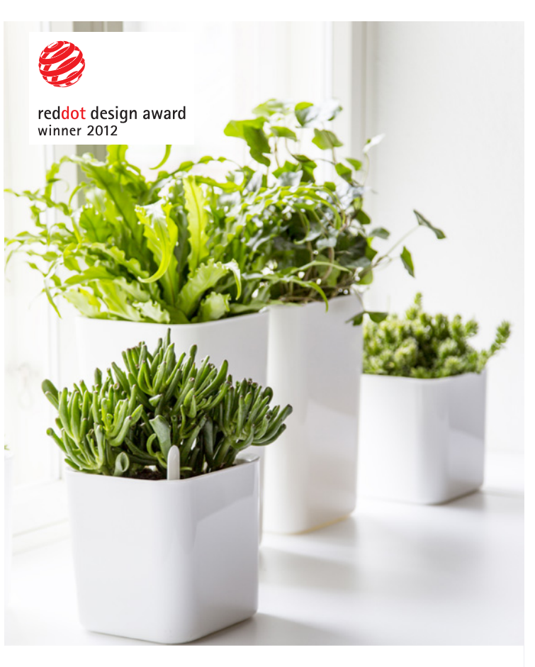
Award-winning Scandinavian design by acclaimed designers

When it comes to product design, we provide solutions for both modern and more traditional interiors. Everyone can find their own favorites that fit with the rest of the furnishing.