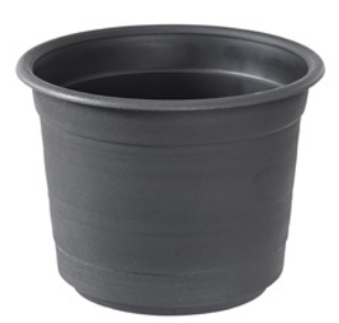
Epoque pot Ø 44 cm 47x47x37 cm 2812790