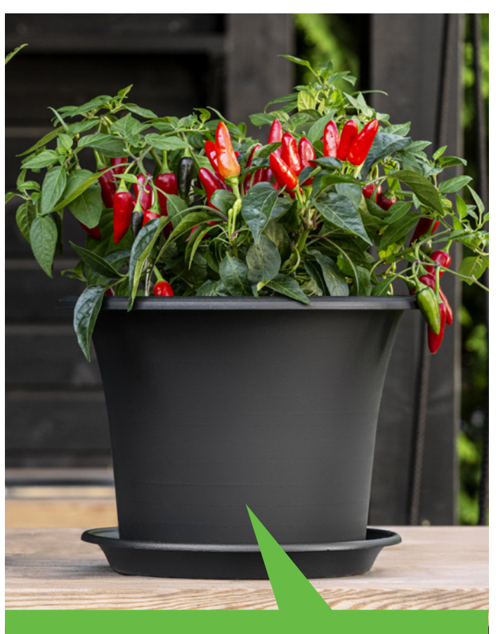
The Botanica pot has a broad top rim which makes it easy to move.

The Botanica ranges offers the many benefits of plastic: easy to move, long-time moisture retention and the ability to be used outdoors even in the winter.