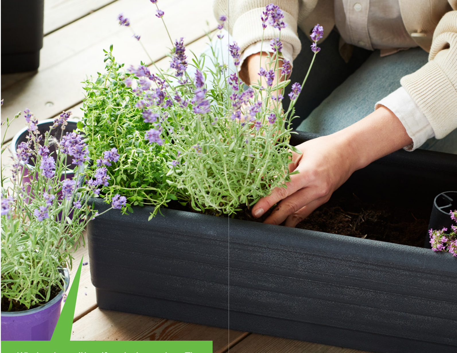
Window box with self-watering system. The water-gauge shows when it's time to top up the water – no risk of over-watering